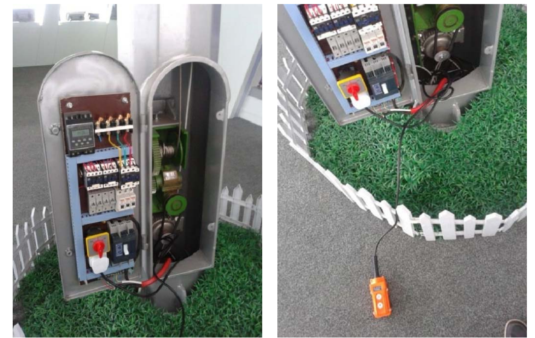
High Mast Control Panel