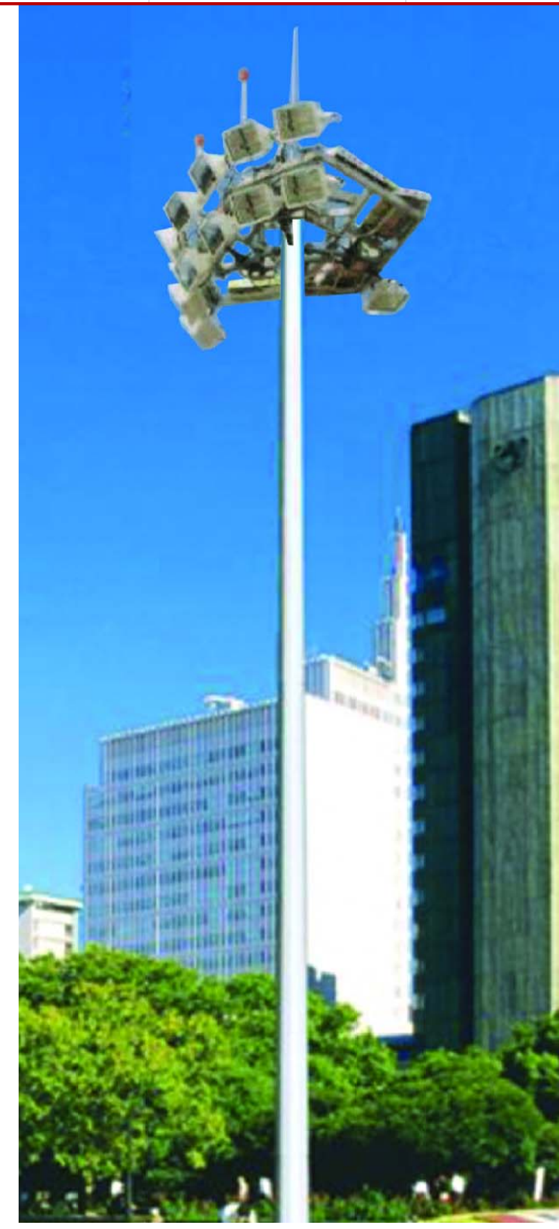
High Mast 35M View